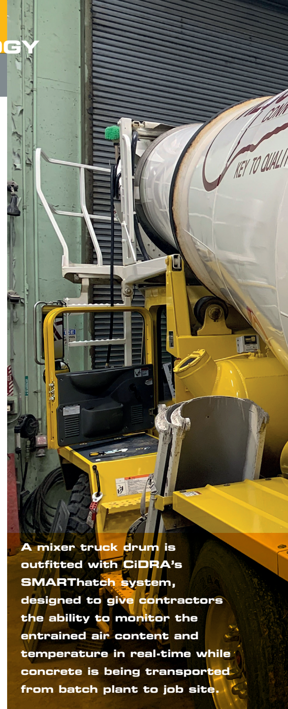
A mixer truck drum is outfitted with CiDRA's SMARThatch system, designed to give contractors the ability to monitor the entrained air content and temperature in real-time while concrete is being transported from batch plant to job site.

Data from the sensor module is delivered wirelessly to a HED CANect Telematics unit, which transmits the information,