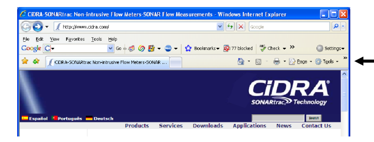
Step 2: Send electronic data to a secure area of the CiDRA web